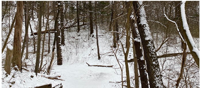
Forest trail leading down to Grenadier Pond in High Park.

As educators devoted to community in the age of global capitalism and climate change, we respond to a reality in which certain stories are privileged over others, and thus, central to our educational work, including this activity, involves unsettling the colonial masternarrative to reveal multitudes of living histories enduring prior, within, against, and beyond it. The activity, which traversed from the park’s north entrance down the forest trails to Grenadier Pond, was punctuated by text excerpts narrating the history of the park that we sporadically gave participants to read aloud; starting with the official placard of John Howard’s benevolent gift of the ‘wooded resort’ to the citizens of Toronto, and confounded in turn by pre-existing activity of Indigenous people along an important Indigenous trade route dating back 11,000 years. These excerpts told just some of the myriad stories that make up the park’s past and present.