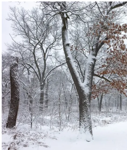
High Park’s Black Oak Savannah in winter.

From there, the group considered how the diameter would reveal the number of rings in their tree. They recalled their idea to estimate the distance between the rings and use division to determine the number. By this point, a shared mental picture of the tree’s circular cross-section was informing the group’s thinking. Benny then pointed out that the diameter would cross each ring not once but twice; indicating that what they needed was in fact the radius, not the diameter. They used mental math to determine that the radius would be 15.75 inches. But how would they estimate the distance between the rings? Leah correctly surmised that the distance between rings may differ based on the kind of tree, and Shlomo pointed out that they may vary even within a single tree as a result of changes in the weather and climate.