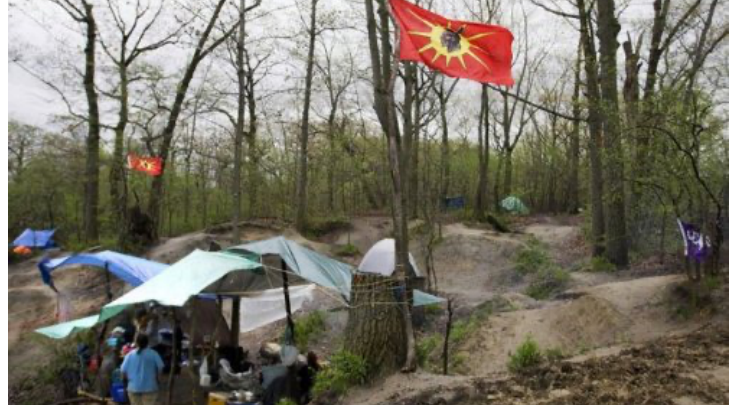
A camp set up amongst BMX bicycle jumps to protect ancient native burial grounds in May 2011. (Red Power Media, 2016)

At this point, we turned our attention to the place where we had been sitting. The next recited quote read that in 1921, during roadside construction, the remains of ten Algonquin people were discovered in a burial site at the north ridge of Grenadier Pond (Donaldson & Wortner, 1995). In the years since, there have been estimates of 57 ancient Haudenosaunee burial mounds said to remain throughout the park dating back 3,000 years (Johnson, 2013; Red Power Media, 2016). Despite the 1921 evidence, whose current whereabouts is unknown, city officials and archeologists have not formally recognized the presence of ancestral remains. In recent years, the area began to be used as a BMX bike course, and an Indigenous-led group began lobbying for the preservation of sacred sites in High Park whose ancestral remains and ecologically sensitive nature were potentially being disturbed (Red Power, 2016; Jackson, 2011). Following community pressure, the City of Toronto eventually conducted an archeological assessment, concluding that no archeological remains were found, and clearing the site of further archeological concern (Robertson et al., 2009).