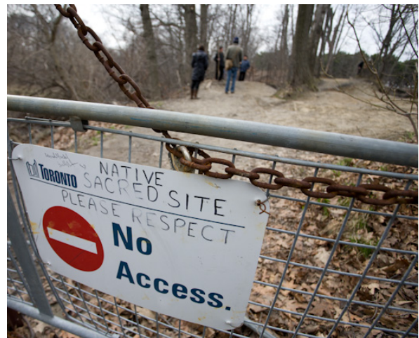
A City of Toronto sign at the edge of the site with a handwritten addition.