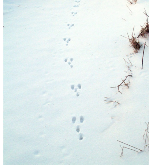
Rabbit tracks in snow.

Using these points of reasoning, we then had participants break off into groups to explore the area and develop stories of animal activity based on what they could trace on the land. Given the low visibility (we were using headlamps and flashlights), we told participants to remain where they were still in earshot of the group; and I thought about how this in itself was a calculation in spatial awareness. By storying the land with possibilities they could trace, we were having participants proliferate the number of stories and interwoven activities conceivably at play across High Park's present and recent past. Placed together, we were constructing a story of stories centered on the wildlife and interplay of ecological forces, to which human narratives merely at times play a part. When we came to listen to each group's stories and examine their evidence, the rest of the group was given the task of responding to the group by suggesting some counternarratives to the one they presented.